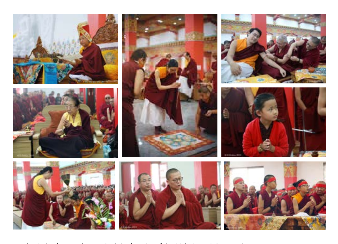
The 25th of November marked the first day of the 28th Great Sakya Monlam.