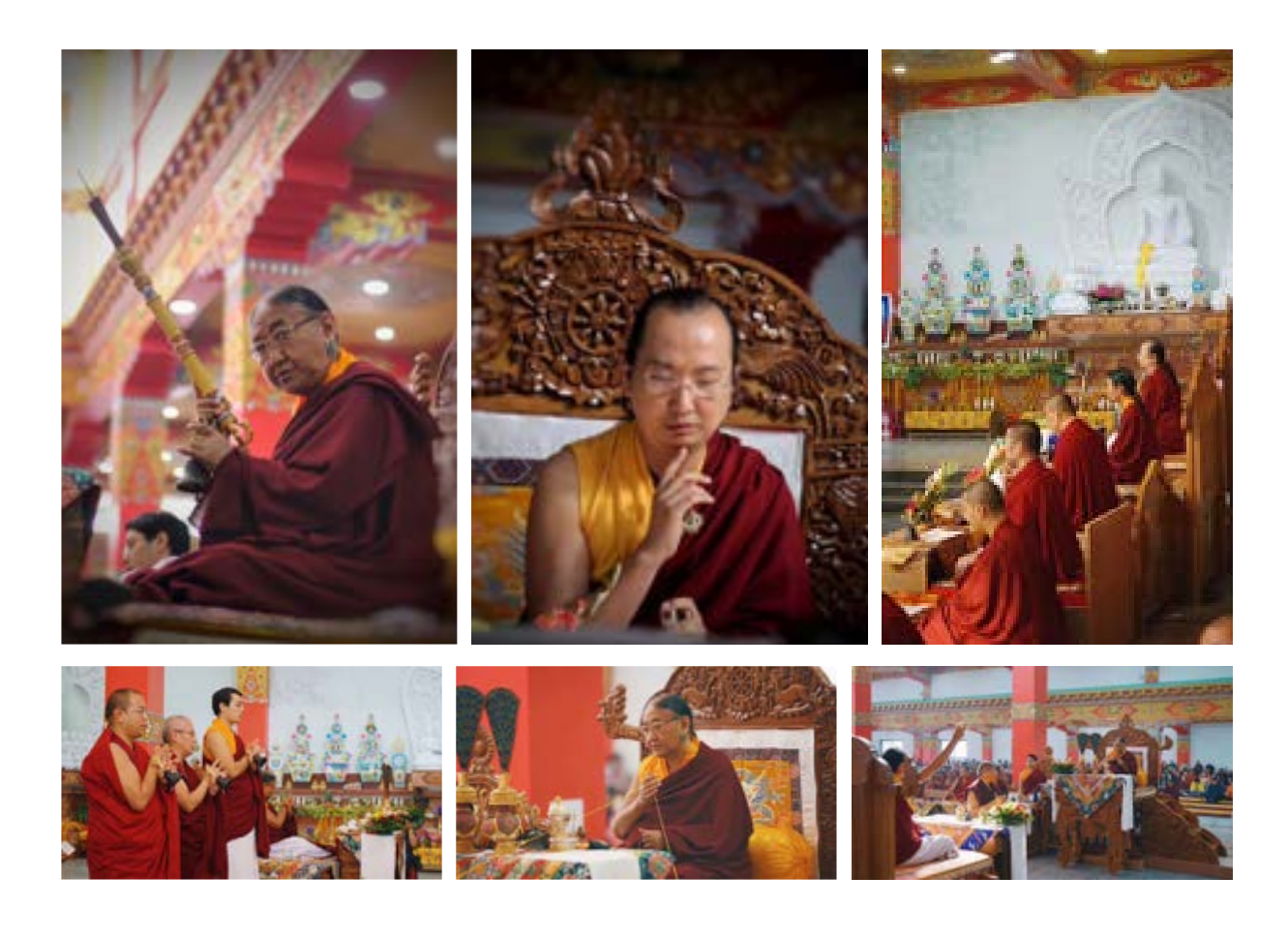
On 22nd and 23rd November, His Holiness Gongma Trichen Rinpoche bestowed the Trikulanatha empowerment in the new temple.